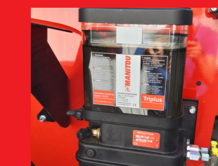
AGS (Automatic Greasing System)