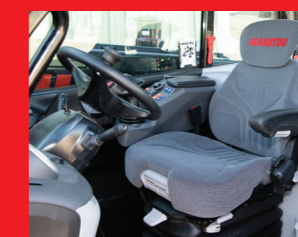
Adaptive air suspension seat